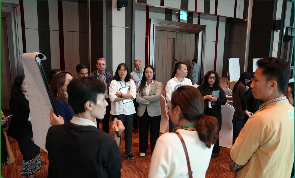
MTT Fellows from Batch 5 at MTT Collaborative Space