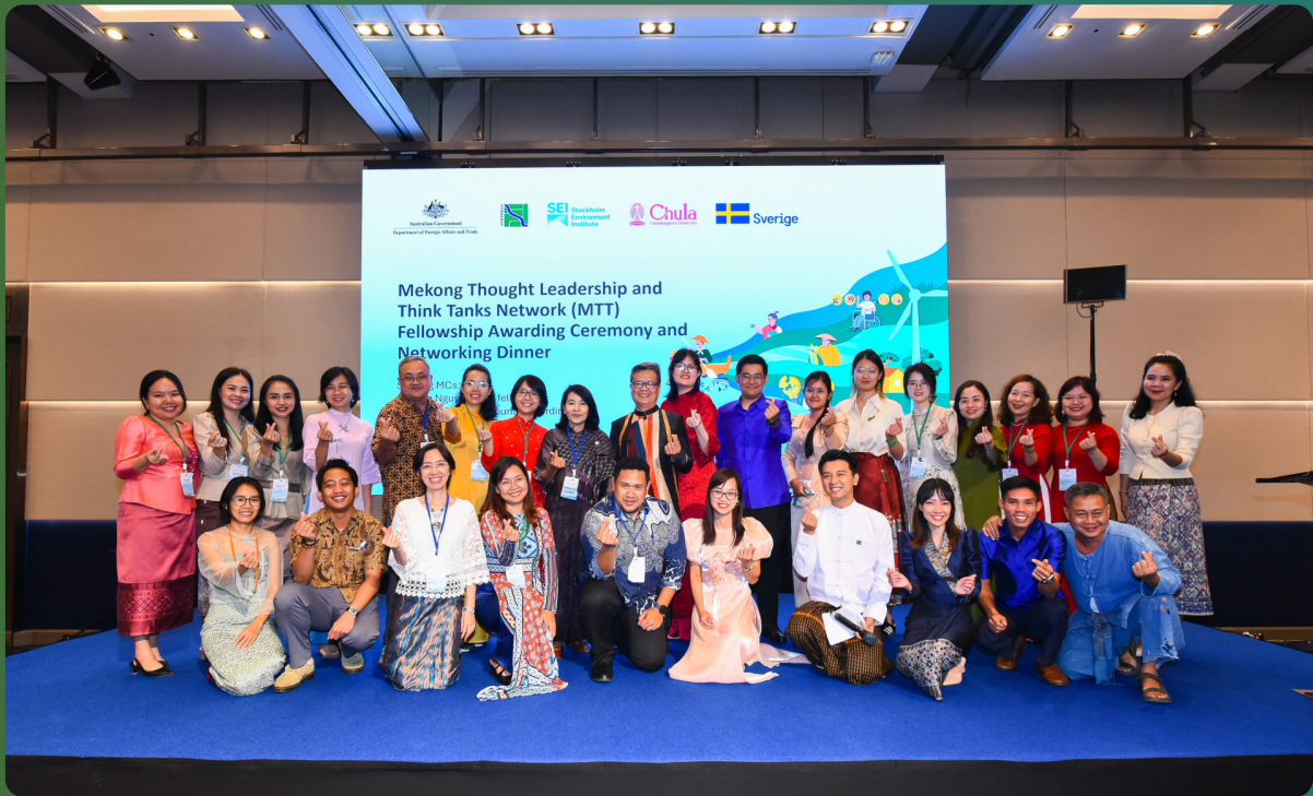
The MTT Fellowship Awarding Ceremony and Networking Dinner